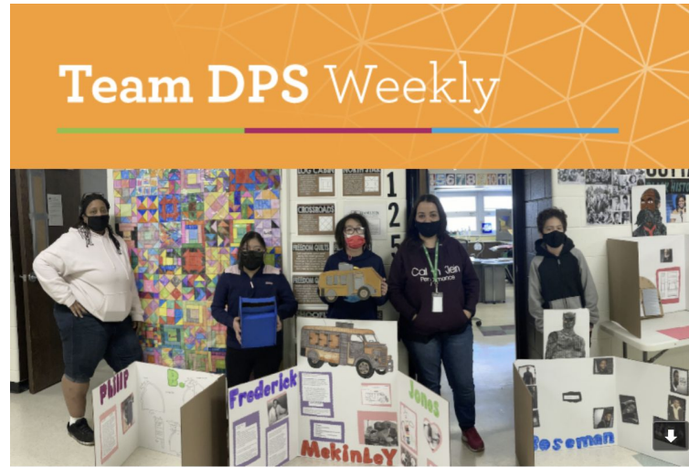
Hamilton Middle School students present their Black History Research projects. See how other schools are engaging in Black History Month below!

Our Multi-Intensive Center Program was featured in the DPS Weekly Newsletter! The students completed Black History Research Projects and confidently presented them to Hamilton staff and students!